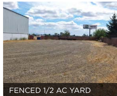
FENCED 1/2 AC YARD