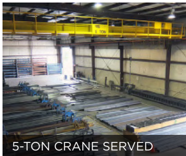
5-TON CRANE SERVED