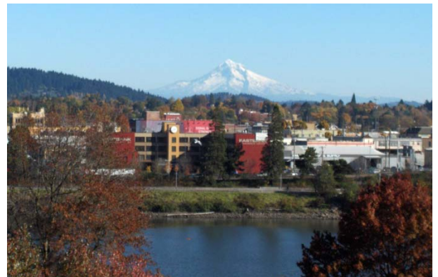
Beautiful River and Mountain Views