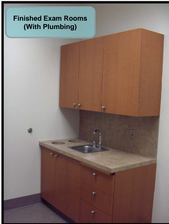
Finished Exam Rooms (With Plumbing)