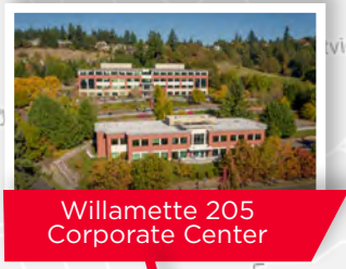
Willamette 205 Corporate Center